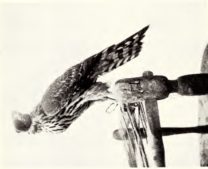
THE EASTERN GOSHAWK ( Astur gentilis schvedowi )

Might become destructive in a particular locality.